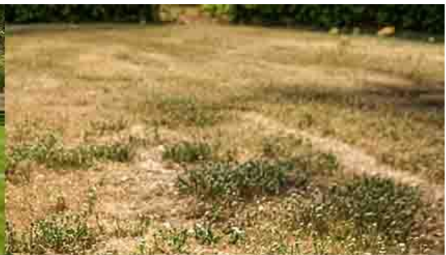
If grass dies, weed seeds germinate