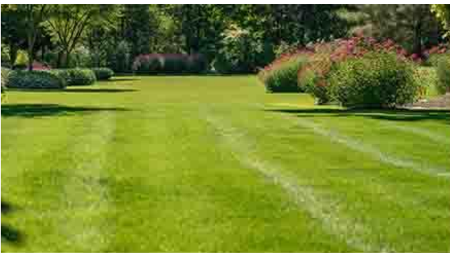
In a healthy lawn, grass suppresses weeds

A good analogy would be your lawn. If your lawn is healthy, it has few weeds. There may be weed seeds hidden among the blades of grass, but healthy grass suppresses them. In the event of a drought, your grass thins out, and weed seeds may germinate and take control of your lawn. In your colon, the normal healthy bacteria suppress any disease-causing germs. However, when you take antibiotics, the number of beneficial bacteria sometimes decreases, allowing harmful bacteria the opportunity to flourish.