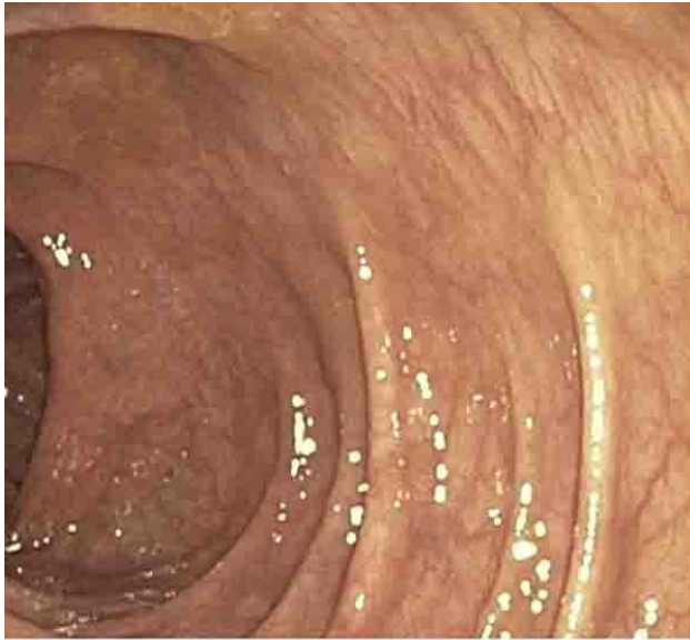
Normal Colon Lining

Clostridioides difficile (klos-TRID-e-OY-dees dif-uh-SEEL)